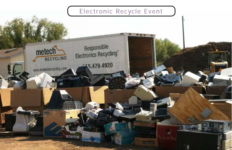
Electronic Recycle Event

The Public Works department offers several programs throughout the year. Many programs are seasonal so visit www.cityoflafayette.com/publicworks for dates and more information.