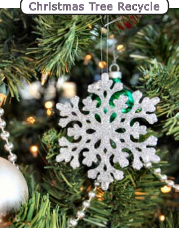
Christmas Tree Recycle

Visit www.cityoflafayette.com/parks for specific dates and location.