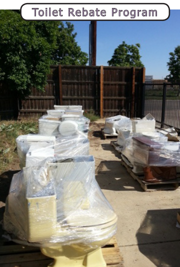
Toilet Rebate Program

Starting in 2015 the Service Center will be open every January and September for the collection of e-waste materials. There is a low cost for residents to drop off unwanted items. See website for a list of acceptable items, fees and dates.